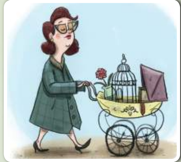
Dora the Storer