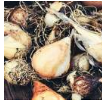
Bulbs ready for planting