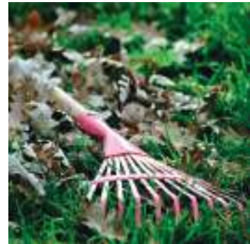
Raking up leaves