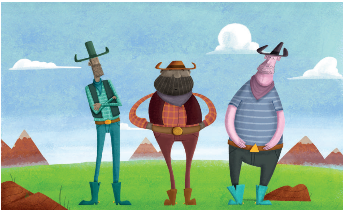
A group of cowboys

Cowboys were needed to move the cattle from one place to another. This could take months, so the cowboys lived and worked together and became friends.