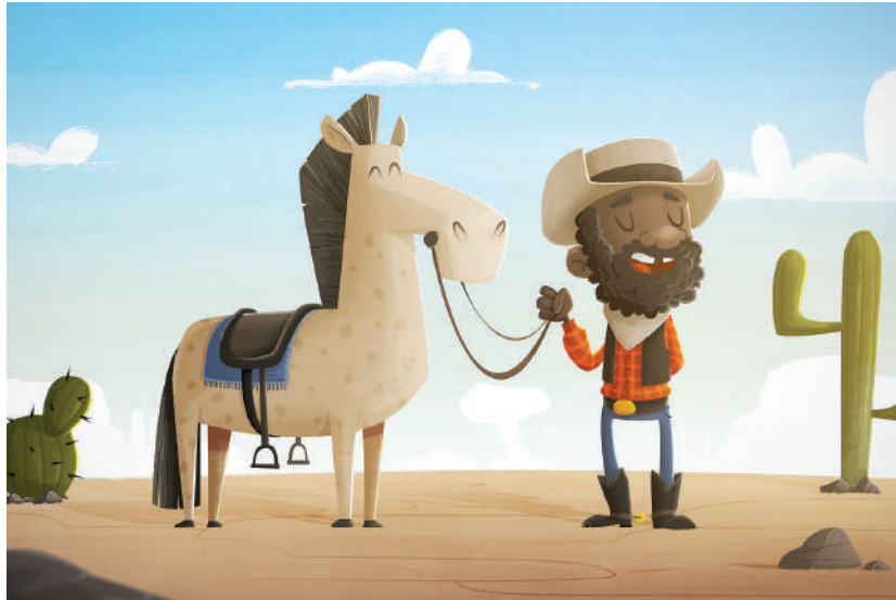
A cowboy with his horse

A long time ago, there were lots of cowboys in North America. Some were young and some were old; most were men and very few were women. They rode horses and looked after cows.