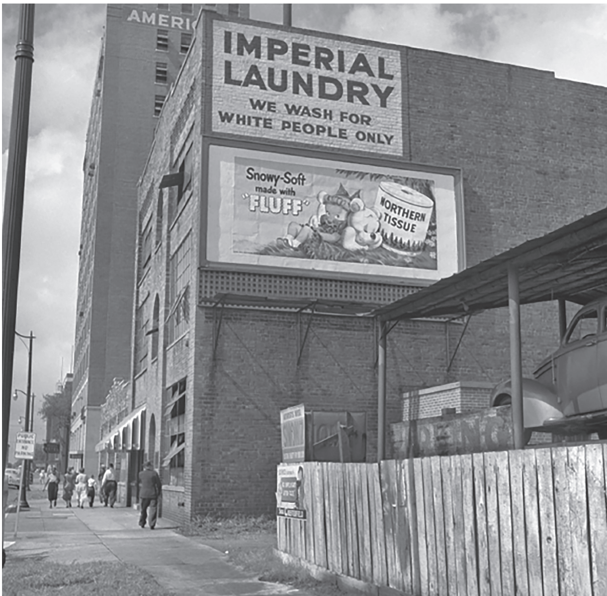
A photograph of a street in Birmingham, Alabama, published as part of an article 'The South: How far has it come from slavery?' in an American magazine in 1951.