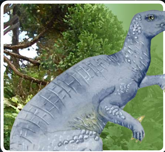
The Lost World