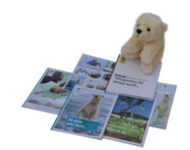
Adopt a polar bear today...

...experts predict that Arctic sea ice could disappear completely in summer by 2040.