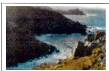
Boat Cove, where Cherry died.

Zennor Head coast guards searched the cove all day until they found Cherry's dead body. She was discovered a mile or so out from Boat Cove, lying on the sand, surrounded by seaweed and cowrie shells. The search party believe that she was collecting shells and the sudden change of weather came quickly: she didn't have enough time to get away. Once she had been dragged under by the sea, she had been carried away from Boat Cove. Half way up a nearby cliff, searchers found a collection of perfect-looking cowrie shells wrapped in a towel. Cherry's parents confirm that these were Cherry's.