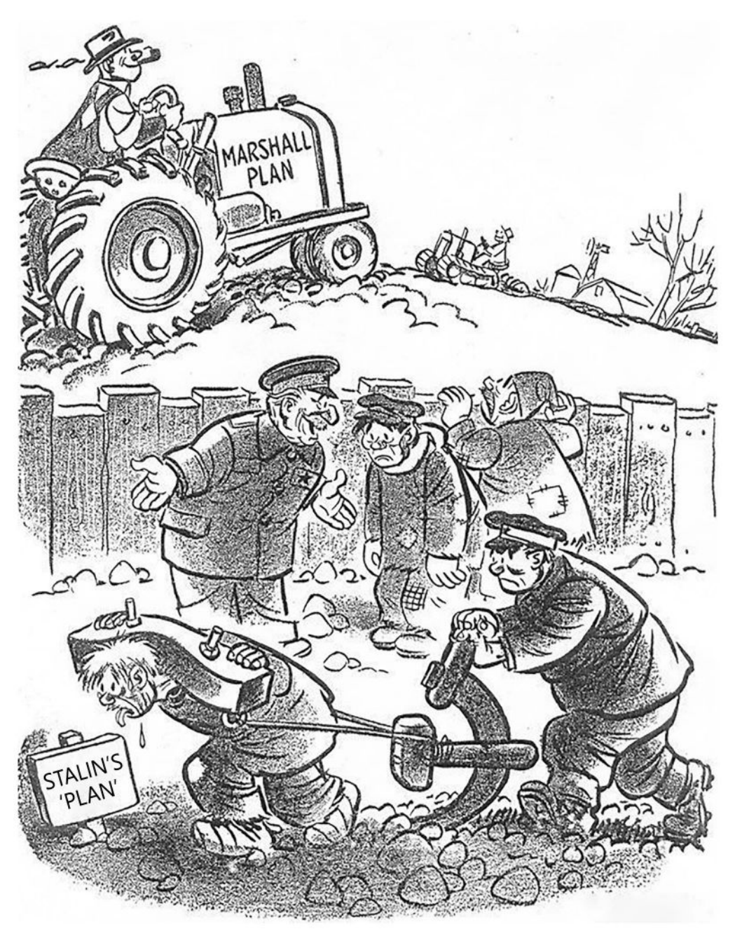
"It's the same thing without mechanical problems"