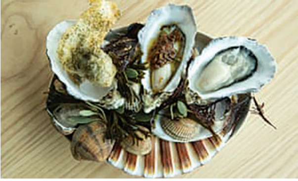
‘With a deep, rich rust sauce’: rock oysters.

Taxis can drop off, though it’s still a walk from the road. Otherwise, it’s a major yomp uphill because there’s no parking. No one would describe it as a model of accessibility. On a beautiful Edinburgh summer’s day when the sun barely bothers to set, this could be joyous. I go on a late November day, when half the North Sea is being deposited on the hilltop. I feel intrepid simply for getting to the door.