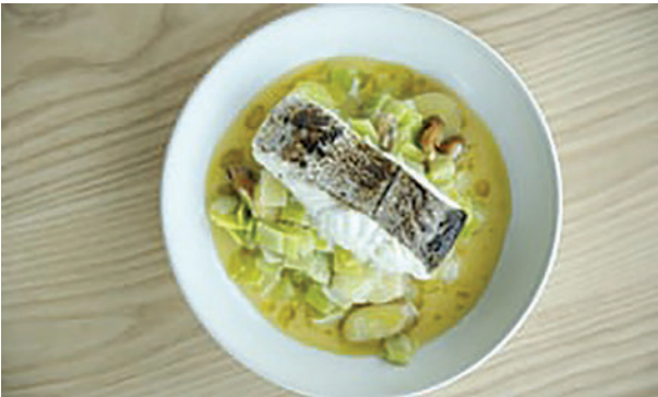
‘In a puddle of buttery broth bringing it all together’: hake, mussels and leeks.

That is the case for the prosecution. Here then is the defence: at lunchtime, when it’s a short à la carte, the Lookout is worth busting your lungs for. The view is spectacular, even when the cloud-base is descending on the city like a duvet being chucked over a bed, but you won’t look up much because the food is so diverting. It is simple ideas, well executed, using great ingredients in the service of big flavours.